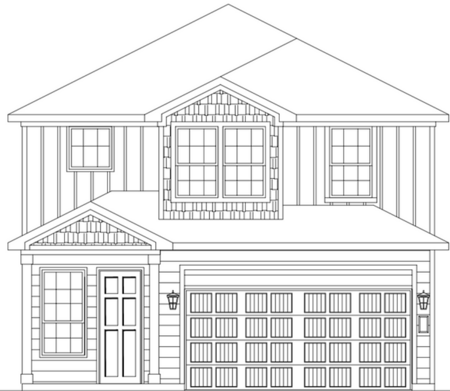
FRONT ELEVATION "B"