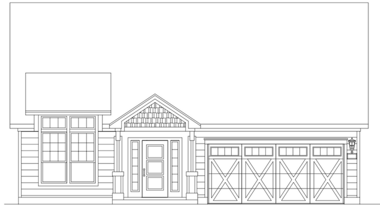
FRONT ELEVATION "B"